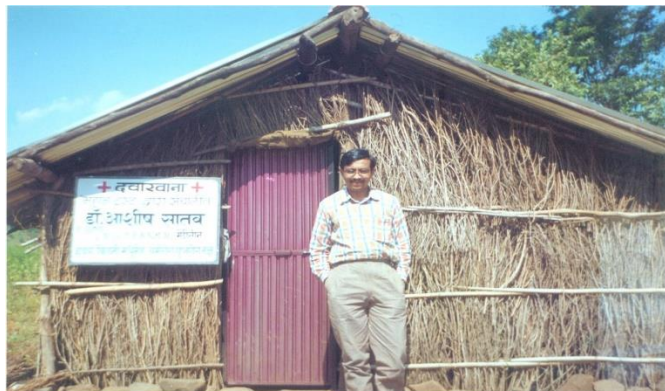
Figure : Hut hospital in beginning