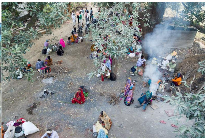
WAITING space for patients