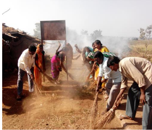
Shramdan @ Berdaballa

10) 200 bicycles were distributed to the needy poor tribal people. It made them self-sustainable and got easy means of transport for education and earning.