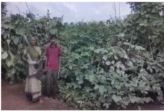
Figure : Nutrition farm Berdaballa