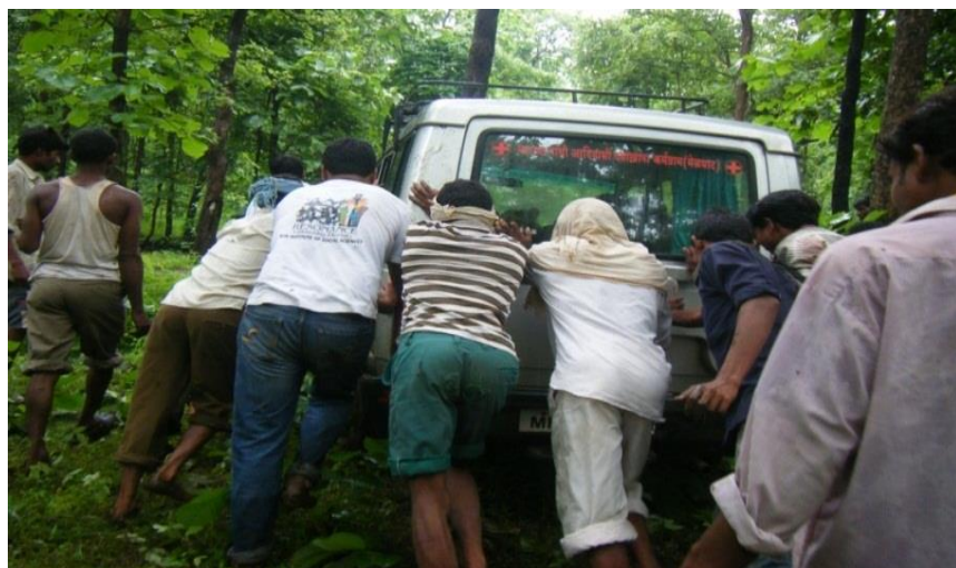
Team of MAHAN clearing the road, trying to push jammed jeep