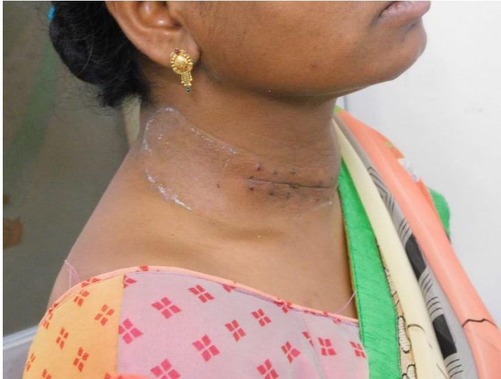
Operated case of Goiter