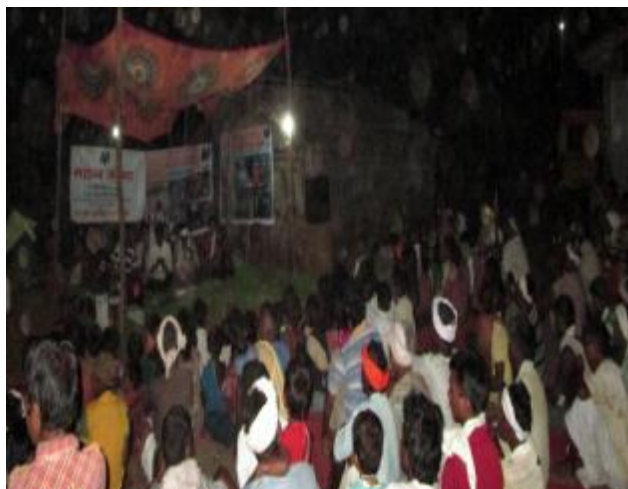
Gramsabha- Village Gathering

We arranged gramsabha in our 100 villages for community participation. The various activities for mass health and nutrition awareness in 32 villages were village cleaning, tree plantation, personal hygiene, nutrition demonstration, health education for infectious diseases and proper nutrition, awareness rally, games for children, street play, village meeting, De-addiction and Malnutrition documentary.