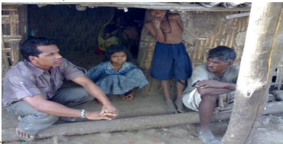
Photo : Counsellor counselling the patient