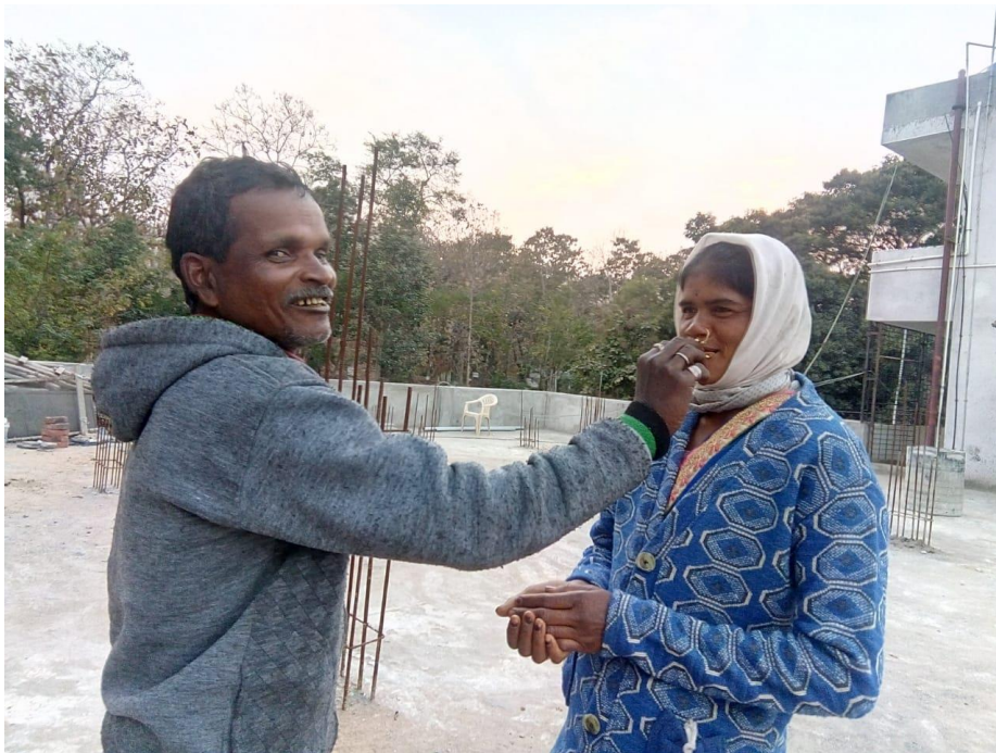
De-addict couple celebrating new life