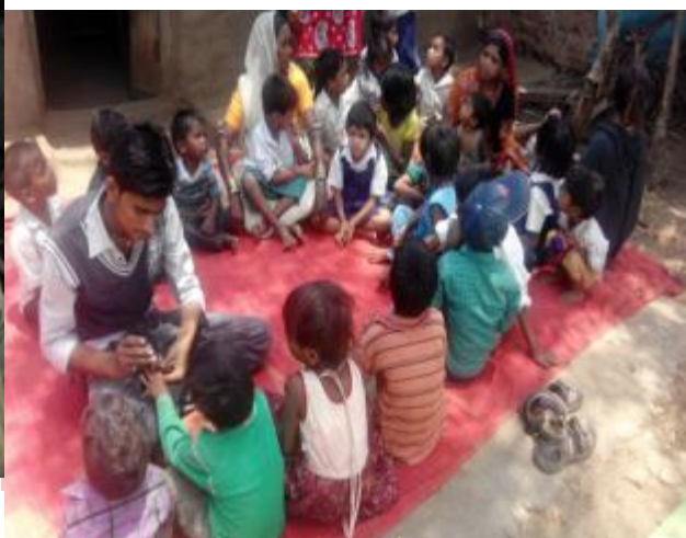
Nail-cutting during Gramsabha

3) Benefitted >10100 people by mobilising various government schemes like MREGS, road, transport, water, electricity, public distribution system, Janani Suraksha Yojana, water supply, land issues, etc.