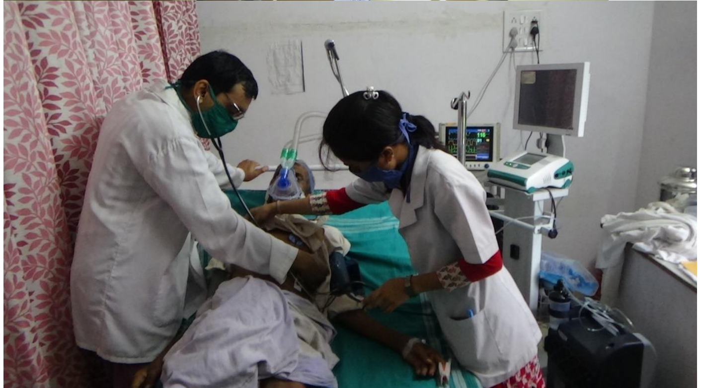
Treatment of serious patient of heart attack