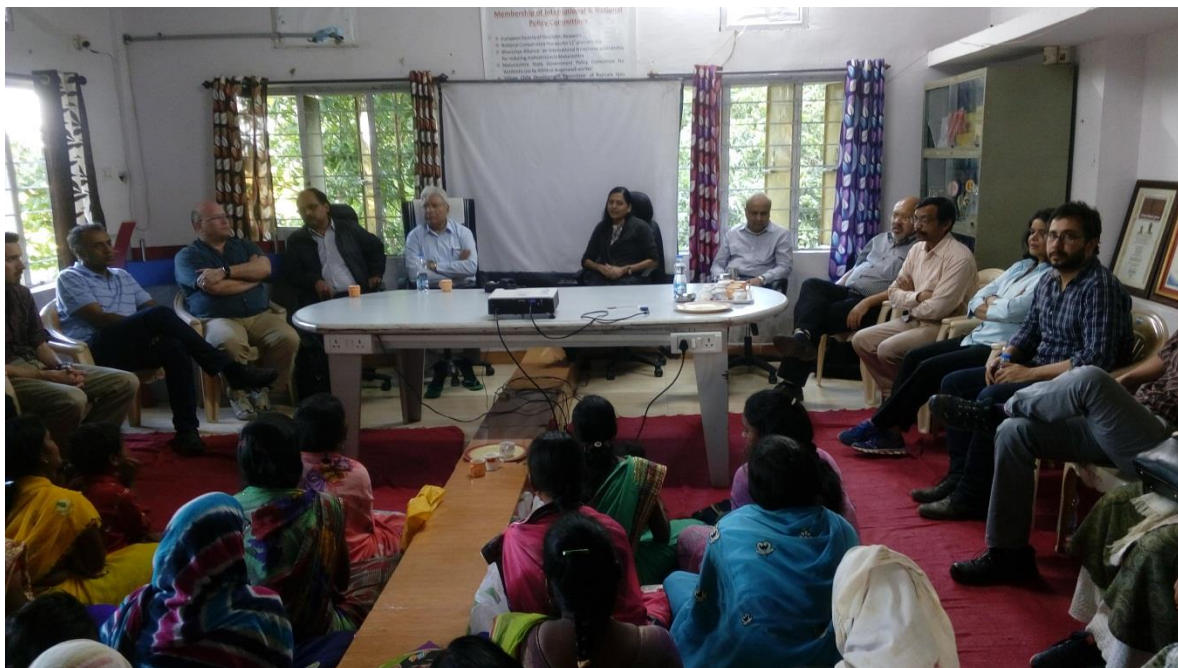
International conference conducted in MAHAN, delegates from 10 different countries attended the conference

Impact: Achieved the target of > 4000 nasal swab collection from Pneumonia and Dead children. System for community health have been developed in 95 villages.