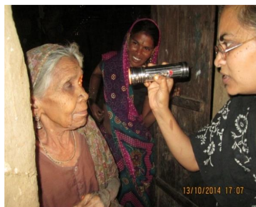
Community level screening for eye disorders