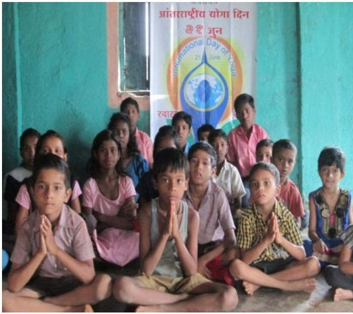
Figure 1 Celebration of International Yoga day